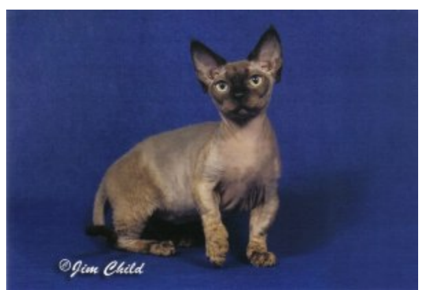
TRT Grizzly Bare - seal mink standard Minskin male

Dear TICA's Executive Office, Genetics Committee and Board of Directors,