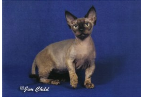
TRT Grizzly Bare - seal mink standard Minskin male

Dear TICA's Executive Office, Genetics Committee and Board of Directors,